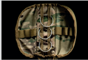
1 Pouch opening