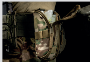
3 Belt clip