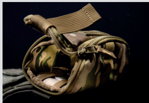
1 Pouch opening