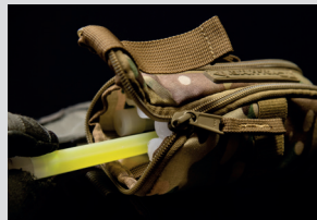
2 Lightstick arrangement