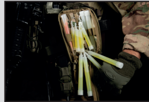
3 Belt clip